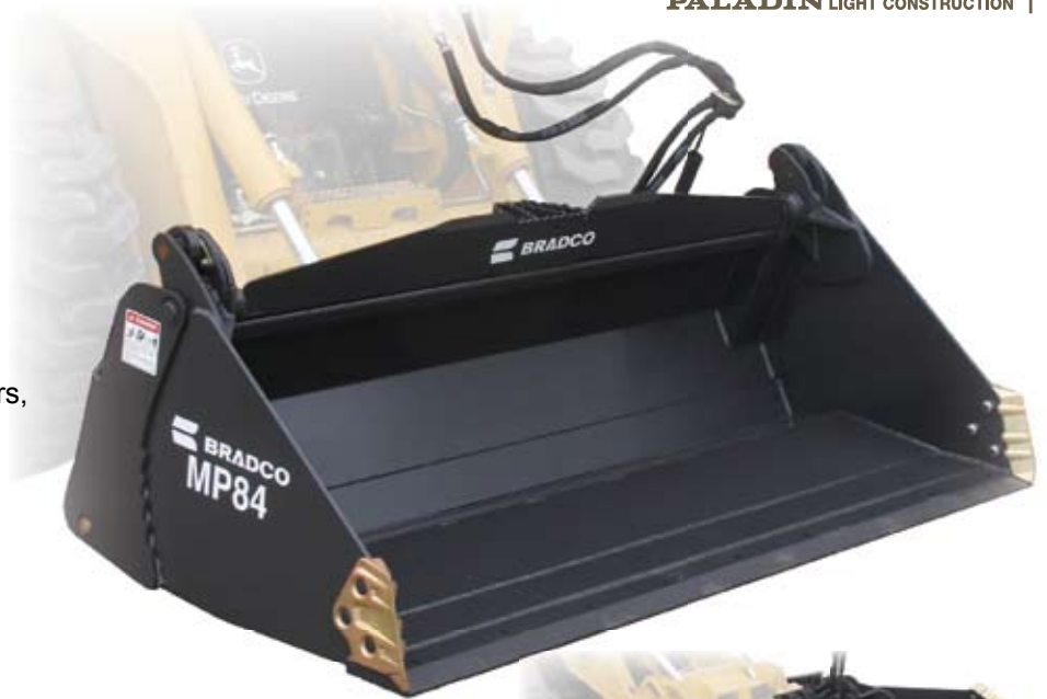
Construction Grade Shown with optional side cutters and spill guard